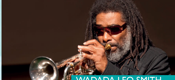
WADADA LEO SMITH

A given project might exploit a particular genre or odd instrumentation, but whatever the slant, it always bears its composer’s inimitable personality.