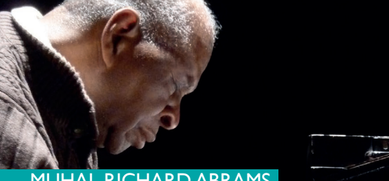
MUHAL RICHARD ABRAMS

World renowned pianist and composer has been in the forefront of the contemporary music scene for well over fifty years. Co-founder of AACM, he was the first recipient of the grand international jazz award, The JazzPar Prize . He was presented with a proclamation by Richard Daley, Mayor of the City of Chicago , declaring April 11, 1999 as Muhali Richard Abrams Day in Chicago.